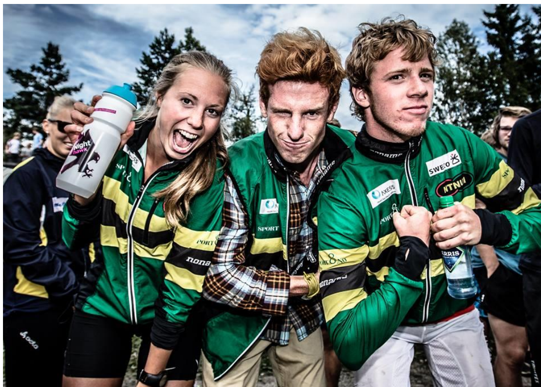
Experience Night Hawk, a social and prestigious orienteering event in Norway.

More info: visit www.nighthawk.no/entry or e-mail: siri.holmboe@gmail.com