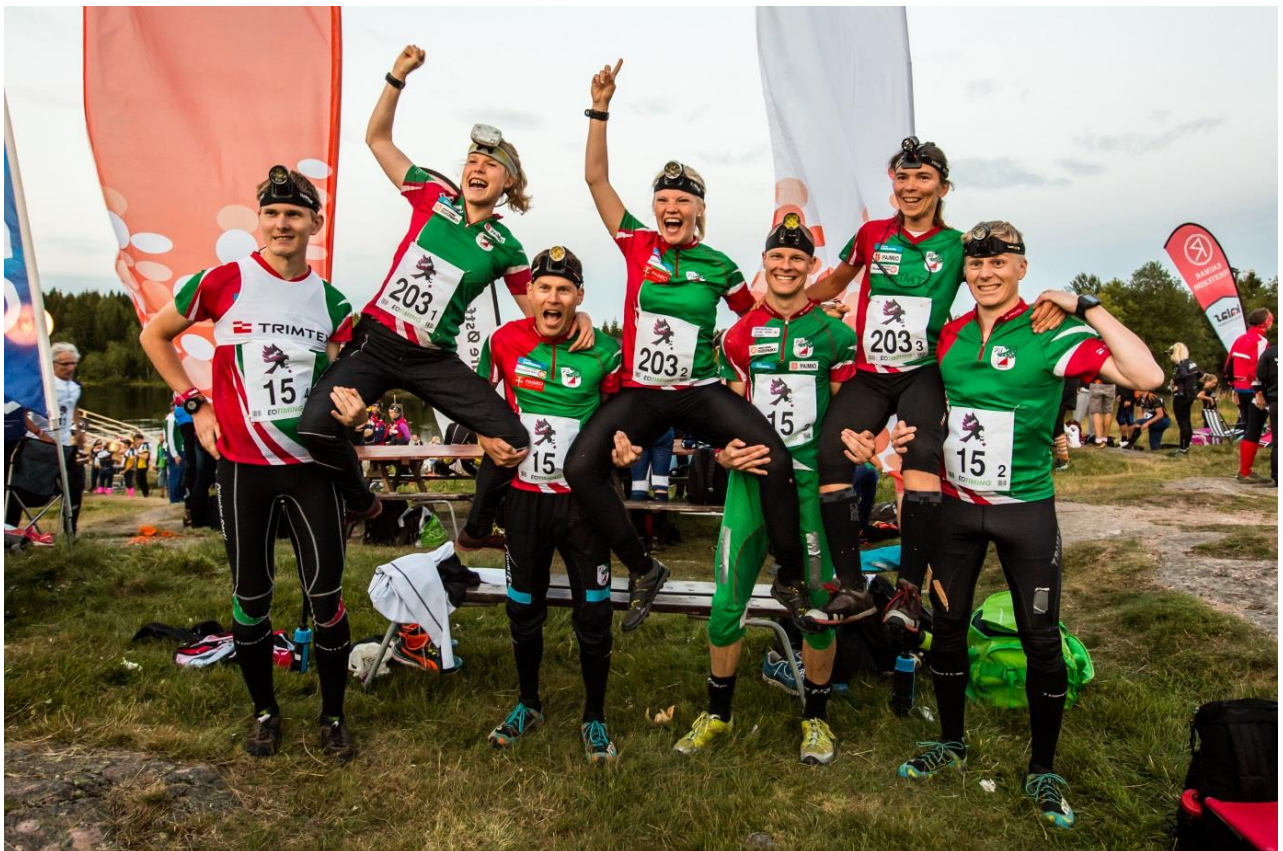
In this picture of an awesome club you see a complete Women's team (3 women runners) and a complete Men's team (4 male runners) In Night Hawk you choose to run either night or day, or both. You choose!